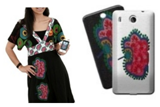
Figure 1 a and b: Kashanipour's Matching Application

Kashanipour [16] (Fig. 1) presents a first attempt to apply the outfit-centric concept using contemporary smartphone technology. Figure 1a shows how a user can take a photo of a detailed pattern on her clothes and use it as the background of the screen, to match the phone with the dress ensemble. This specific action could easily be performed with the standard software of any smartphone, but an application that specifically promotes this use might lead a fashion-conscious person to treat the phone as part of a dress ensemble. Figure 1b shows the pattern from the dress printed on a sticker attached to the back of the phone. This illustrates the important difference between personal expressions displayed on the screen of a mobile device, and the public appearance of its back. This app