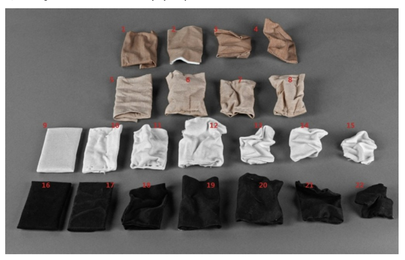
Figure 2. The 22 designed shapes of a shape-switching device

These shapes were inspired by fashion aesthetics, where the design of clothes depends on the color of the fabric and the cut and form of the garment. In doing this, the designer had to take not only the outfit-centric concept into account, but also users' taste. The results might have