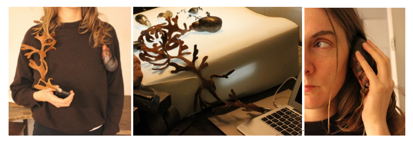
Figure 4. The Seaweed speaker; a) wearing the Seaweed speaker as a necklace, b) the Seaweed speaker with laptop, c) listening to the music from the copper shell-speaker.

It functions as a mobile speaker, crafted in a sculptural form out of leather, which resembles a seaweed plant. On a surface level, the main function of this artefact could be read to provide another way of using and experiencing a mobile speaker as an electronic and mobile device. The Seaweed speaker connects to a device such as a mobile phone or a laptop, and can be either worn as a necklace (Figure 4a), placed on a surface (Figure 4b), or probably hung on the wall, leaving an increased openness or ambiguity in terms of where it can be placed, and accordingly, how it can be used or experienced as a device. But the user can also decide whether to fully expand it as a sculptural object, or entangle it in order to occupy less space. In the case of wearing the Seaweed speaker as a necklace, the user can bring the copper seashell, where the speaker is hosted, close to the ear to listen to the music, as shown in Figure 4c. Leather was chosen as a material to host the cables of the device because it can be easily deformed and shaped in different directions. The floppy leather parts can be placed in different ways, while no way is ever to be expected as better than any other. The organic shape reduces any expectations for symmetrical perfection