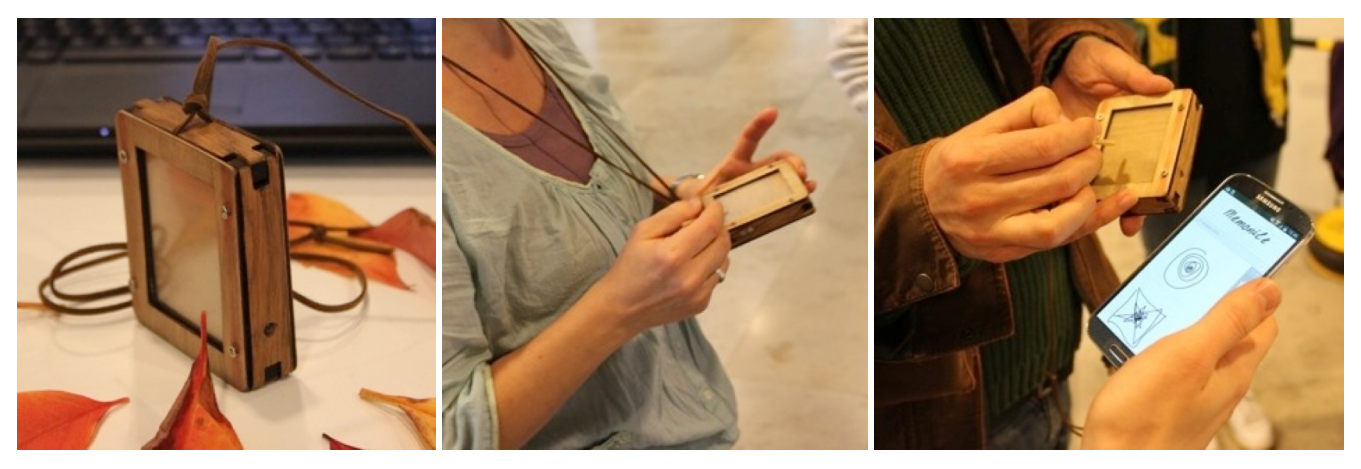
Figure 1. Memonile Necklace; a) overview picture of the device, b) device in use, c) device next to a smartphone, showing feed tracking the screenless doodles and gestures performed on the Memonile.

understanding of Wabi-Sabi, by presenting physical as well as interactive gestalts that emphasise aspects of repair, tweaking, and customisation. We also found them intriguing since their overall appearances depart in different ways from common norms in the design of interactive gadgets. Further, these artefacts were physically accessible to us, as we were able to experience their interactive qualities hands on, and discuss them with their makers. Finally, they cover a range of interactive arenas (design, performance, haptics, art), which allowed a discussion across different types of use settings.