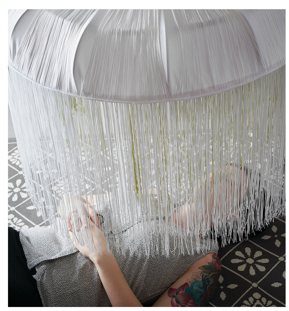
Figure 2. The Breathing Light.

We name the strong concept arising from our design work Somaesthetic Appreciation. A Somaesthetic Appreciation design will engage in specific interactions when it comes to timing, modalities, aesthetics, and intensity of feedback. In terms of timing, we found that the system has to be right there, right when you turn your attention to some part of your somatic experience. It cannot arrive too late or too soon. It also needs to arrive subtly, increase in intensity, and then disappear slowly—not in an on-off fashion. In terms of modalities, our experience so far says that modalities that allow for a felt, subtle, inwardlooking experience are key. Anything that puts too much emphasis on explorations outside your own body, such as 3D sound or visualizations in the ceiling directing your attention outward, will not work. And again, the modality has to subtly attract your attention; it cannot be crude and demanding. We found the aesthetics of heat particularly evocative in our work. Heat is intimate and skin-close, but, when not too hot, rather than being crude or invasive produces a welcoming somatic response, opening our mind to the sensations and questions posed by the accompanying vocal instructions. Finally, throughout our design efforts, we had to work hard to get the right intensity—no matter which modality—of feedback. If the heat got